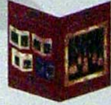
Passenterie Collection Volume Three Item No. 39040

These collections samples can be yours by calling the friendly staff at Sullivans and quoting the sample card number or including them on your next order. These cards each come with their own price list and show actual samples of our cords, braids, fringing, and colour ranges along with colour photographs of tie backs and tassels.