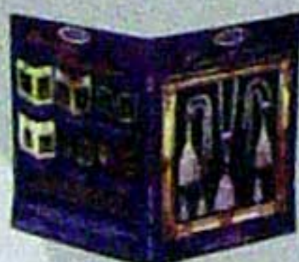
Chenille Collection Volume One Item No. 39041