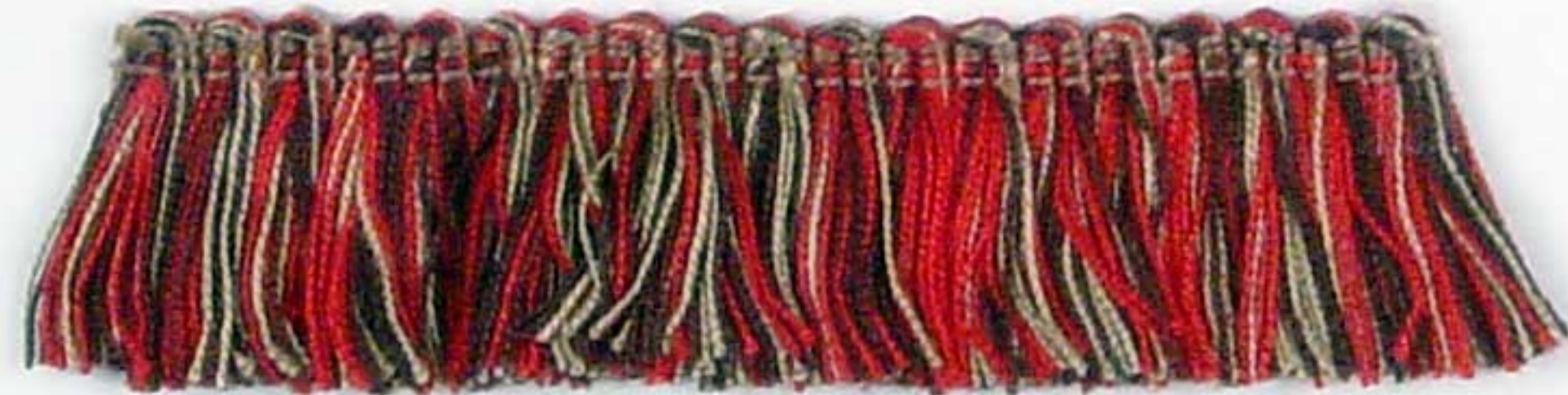
Art: 265 40mm (1 1/2") Ruche Fringing