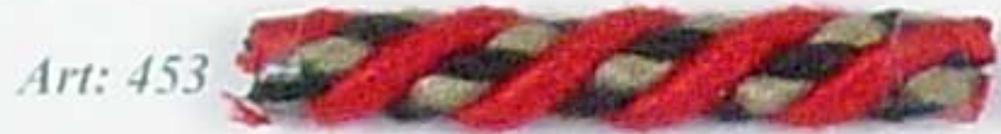
Art: 453 Double Twist Cord 10mm (3/8")