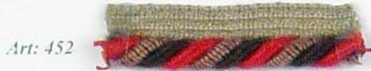
Art: 452 Twist Flange/Lip Cord 8mm (5/16")