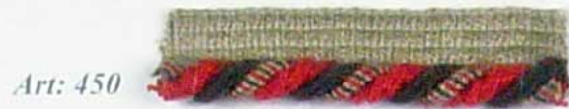
Art: 450 Twist Flange/Lip Cord 6mm (1/4")