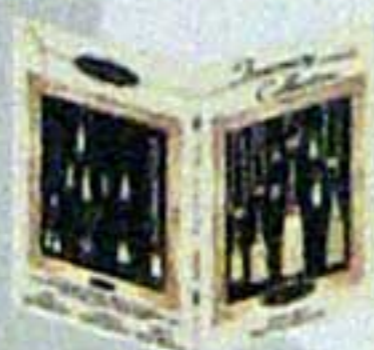
Treasury Collection Volume One Item No. 39038