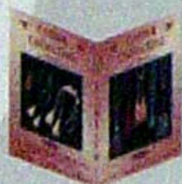
Cotton Collection Volume One Item No. 38065