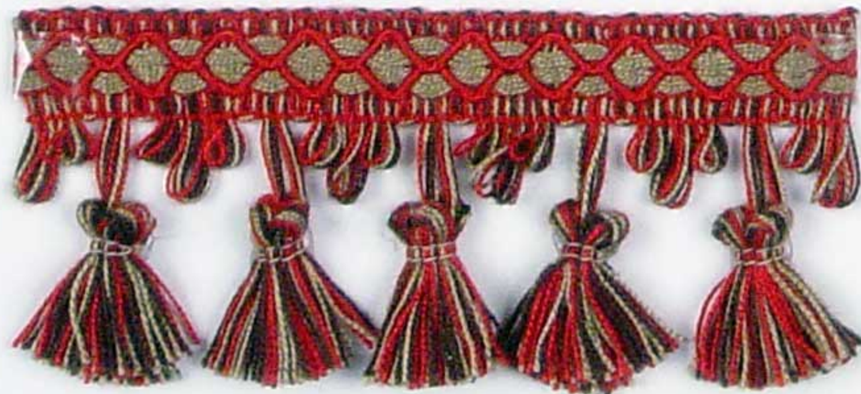
Art: 457 65mm (2 5/8") Tassel Braid