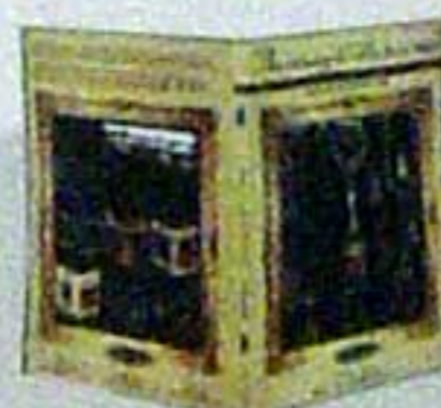
Treasury Collection Volume Two Item No. 39043