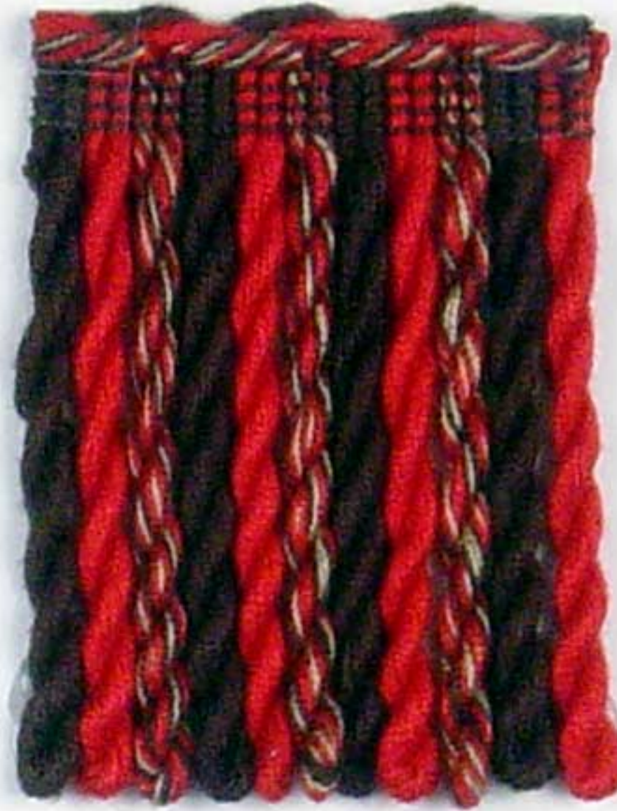
Art: 270 Bullion Fringing 150mm (6")