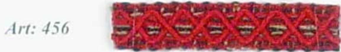
Art: 456 Braid 15mm (19/32")