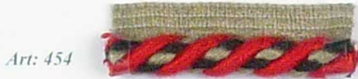
Art: 454 Double Twist Flange/Lip Cord 10mm (3/8")