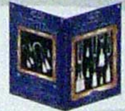
Passenterie Collection Volume Two Item No. 39039