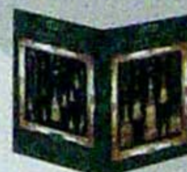
Majestic Metallic Collection Volume One Item No. 39042