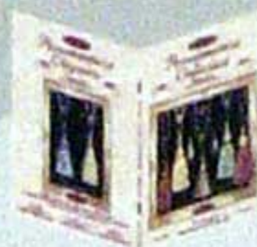
Passenterie Collection Volume One Item No. 39033