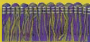
Item 91136 - ART 391: 30mm Ruche Fringe Packed by 20 metre Card Item 91151 - ART 392: 40mm Ruche Fringe Packed by 10 metre Card