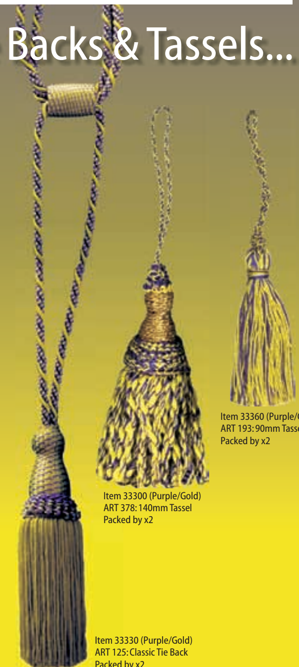
Item 33360 (Purple/Gold) ART 193: 90mm Tassel Packed by x2