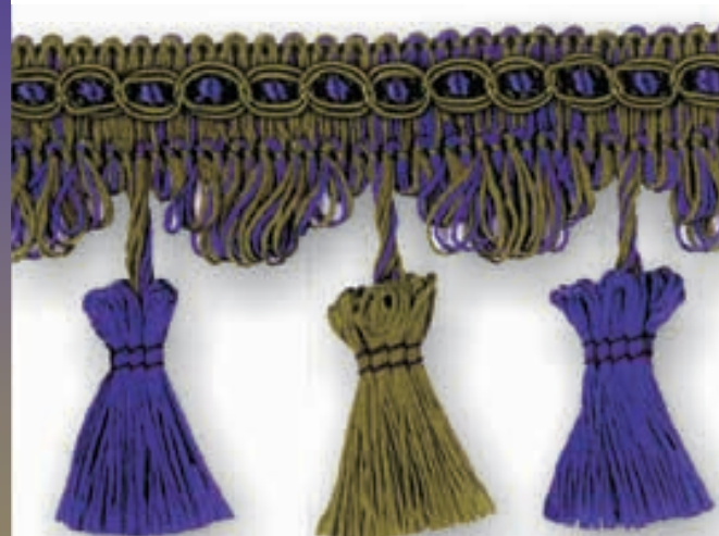
Item 27025 - ART 397: 70mm Tassel Braid Packed by 20 metre Card