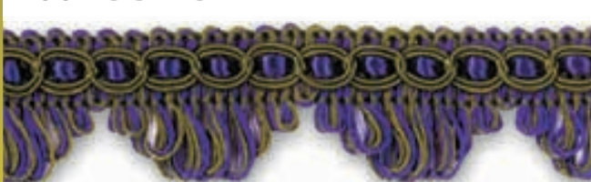
Item 26995 - ART 395: 30mm Looped Braid Packed by 20 metre Card