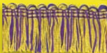
Item 91137 - ART 391: 30mm Ruche Fringe Packed by 20 metre Card Item 91152 - ART 392: 40mm Ruche Fringe Packed by 10 metre Card