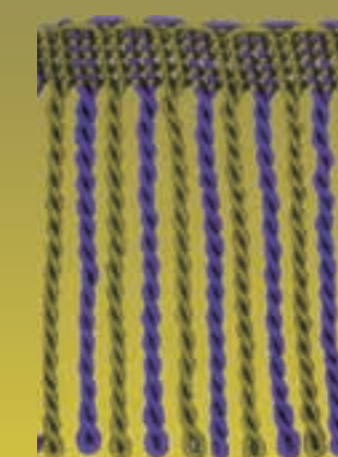
Item 91196 (Purple/Moss) ART 401: 50mm Bullion Fringe Packed by 30 metre Card Item 91197 (Purple/Gold) ART 401: 50mm Bullion Fringe Packed by 30 metre Card