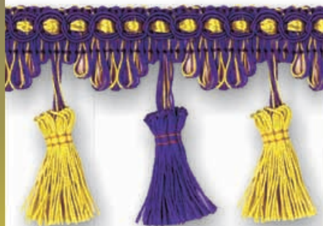
Item 27026 - ART 397: 70mm Tassel Braid Packed by 20 metre Card